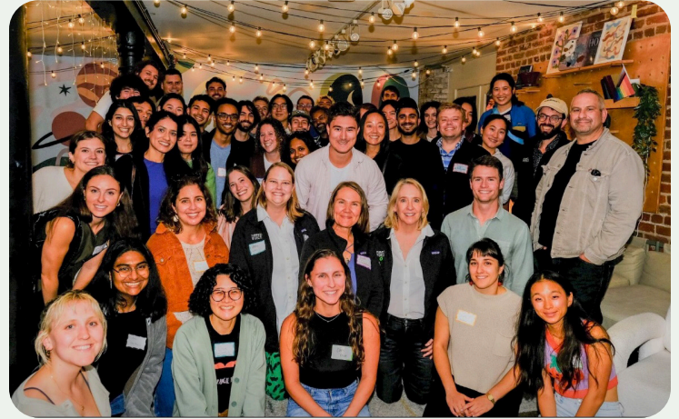
ClimateVoice + Climate Action Club event, October 2025

such as a webinar on Employees Leading Climate Action in Uncertain Times , which featured a conversation with employees from companies like Amazon, Google, and Pinterest who are keeping climate and sustainability on the agenda. They shared honest insights about what's working, what's not, and how they're adapting their approach to stay effective. We participated in events at Climate Weeks throughout the year and co-hosted a Climate Advocacy Dinner with Soapbox Project during Pacific Northwest Climate Week, where employee advocates gathered to consider how to most effectively lead climate action at work, and navigate the setbacks underway.