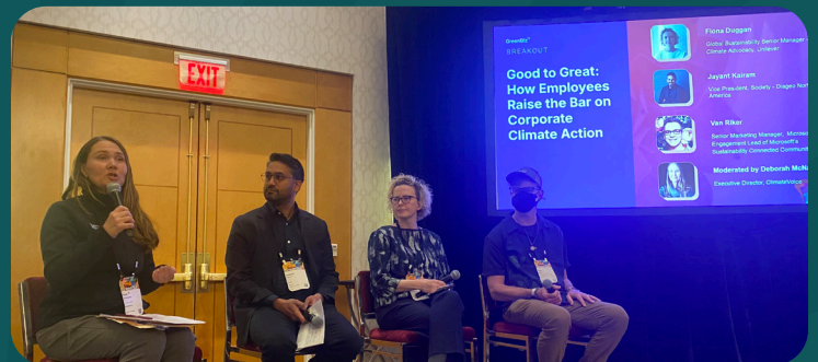
Good to Great: How Employees Raise the Bar on Corporate Climate Action